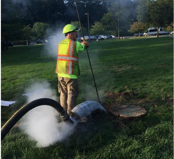
Steam Curing of CIPP Liner