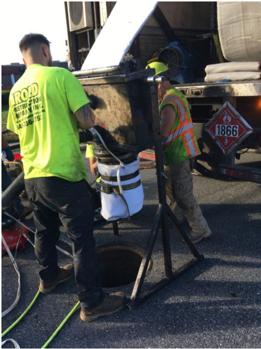
Installation of CIPP Liner