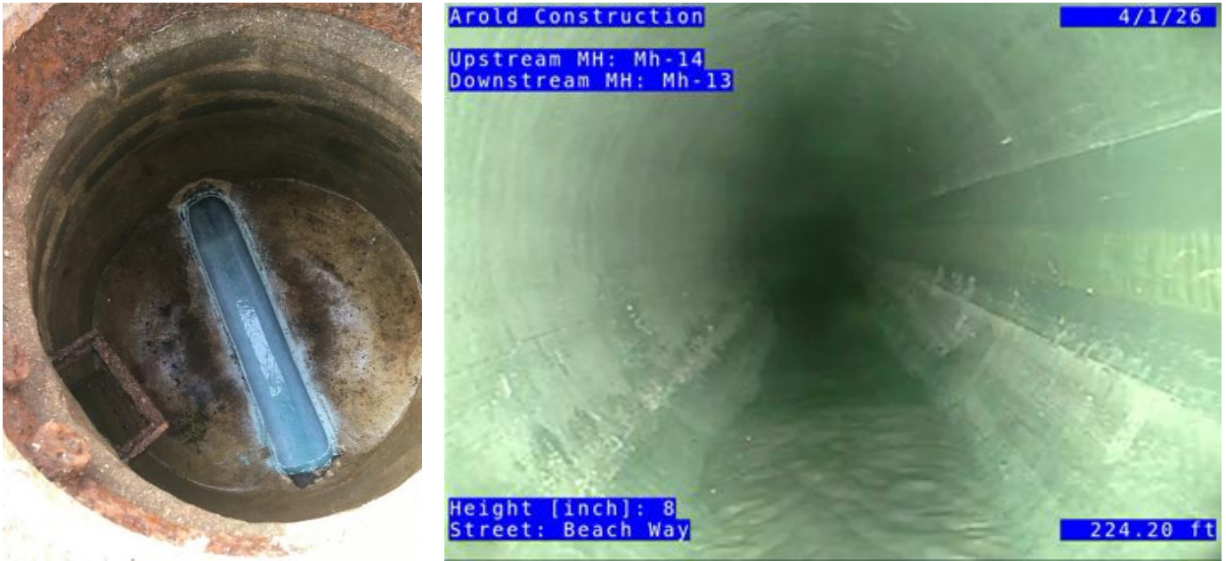
Inside View of CIPP Lined Invert of Sanitary MH and of CIPP Lined Sanitary Sewer Main