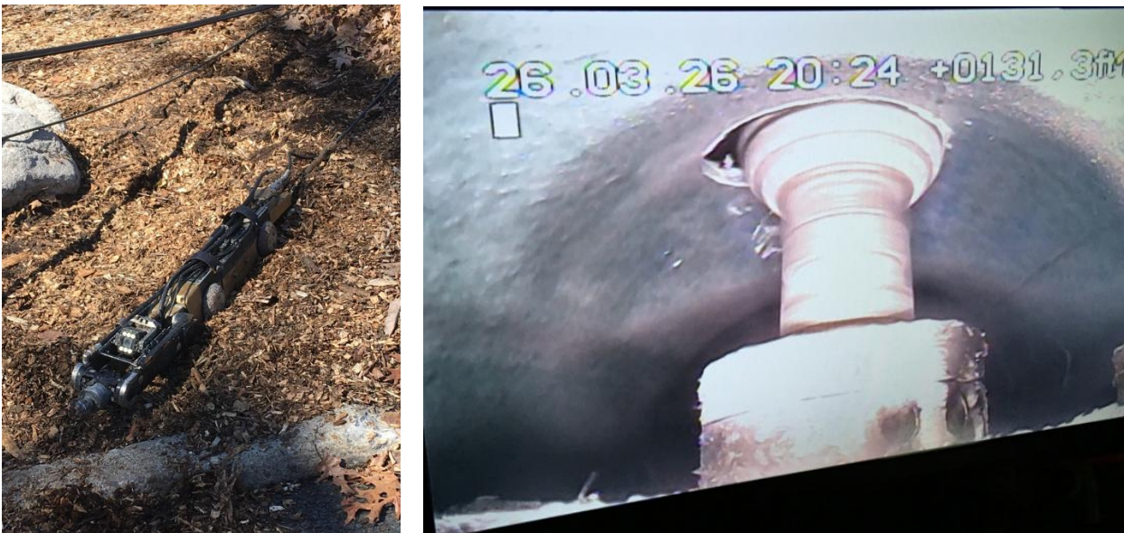
House Service Connection Cutting Tool/CCTV View of Reinstating House Service Connection