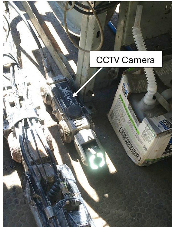
CCTV Inspection Monitor/Camera